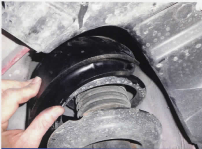
INSTALL WITH THE LARGER WINGS POINTED DOWN