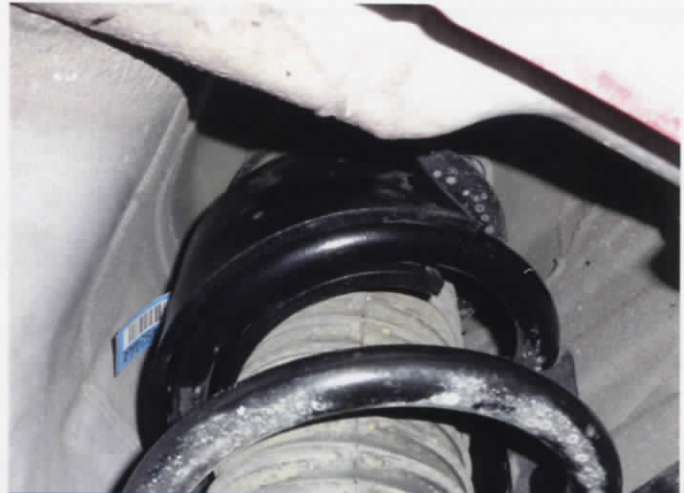
COIL SUMOSPRINGS FULLY INSTALLED

gap has no effect on the Coil SumoSprings performance; it can face inboard (towards the other side of the Travato), or outboard (towards you, the installer). Once in place, use the included zip ties to secure the Coil SumoSprings to the coil spring. Attach the zip ties to only the top holes (the short wing side). This is to prevent the Coil SumoSprings from coming out of the turn in the coil if you experienced extreme vertical travel.