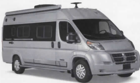
2019 Travato Built on Ram ProMaster® 3500 chassis