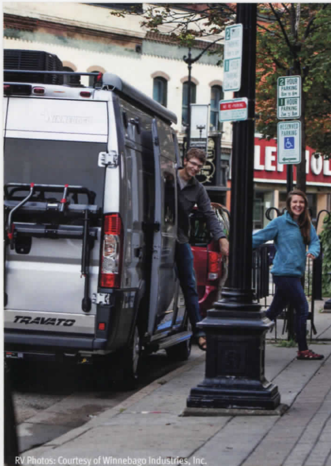
RV Photos: Courtesy of Winnebago Industries, Inc.