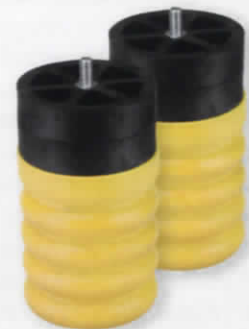
Rear | SSR-313-54 2800 (lb) Capacity at 50% Compression