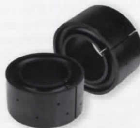
Front | CSS-1195 Coil capacity increased by 15% to 30%