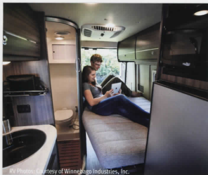
RV Photos: Courtesy of Winnebago Industries, Inc.